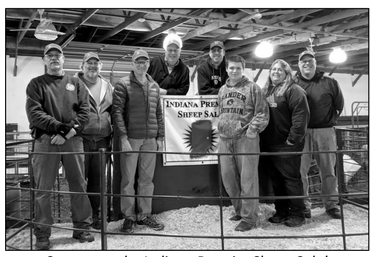
See you at the Indiana Premier Sheep Sale!