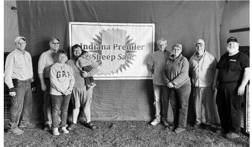
See you at the Indiana Premier Sheep Sale!

Winners will be announced at beginning of Shropshire sale!